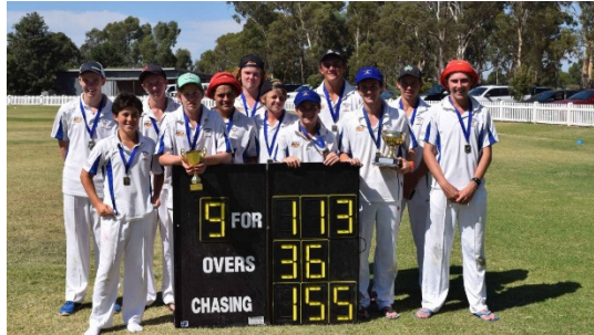
The victorious Barham-Koondrook under 17 cricketers.

Looking at the aerial photo of Koondrook cricket ground, you'd never guess that two thirds of it is a Crown reserve (coloured grey on the plan), and one third is freehold owned by the Shire of Ganawarra (coloured buff).