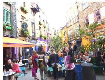
Neal's Yard, Covent Garden

London's Brunswick Centre is, believe it or not, public housing. It always had architectural presence, but until recently, was commercially dead and socially ghettoised – an urban failure to equal the worst of Melbourne's Housing Commission legacy. Now, a collaboration of private and public investment has transformed it into a model of liveability, enlivening the whole precinct; the beneficiaries including its own council-subsidised tenants.