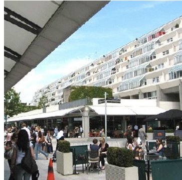
The Brunswick Centre, Bloomsbury

Las Ramblas is the main drag in Barcelona – but you could hardly call it a road. It's alive with all manner of street vendors and entertainers; you might even see the invisible man. Three factors in combination make it work: its physical form, its commerce (both monetary and social), and its governance regime, shaped by the Ajuntament , or council. Las Ramblas is the Sunday market on St Kilda Esplanade, writ large, and doing business twenty-four seven.