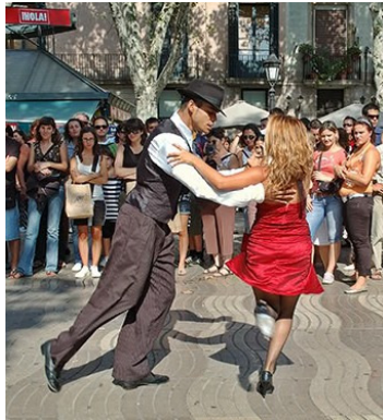
Tango dancers, Las Ramblas, Barcelona

We didn't need to squeeze ourselves into our urban environments, to maximize land efficiencies, to create the multiple-function public spaces which so typify and define European urban form – and hence European urban life. In America, Manhattan alone is a walled city – walled in by its encircling rivers – and it's Manhattan's public places that make it uniquely a quasi-European city.